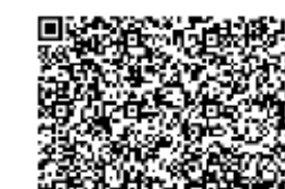
Pengarah Pusat Khidmat Kontraktor