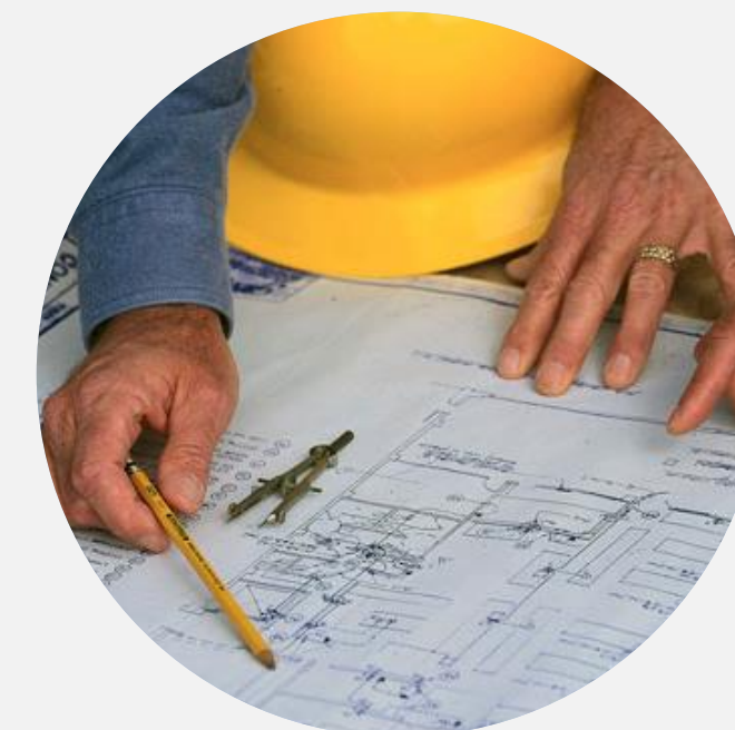
ENGINEERING SERVICES (CME-ELV-TELCOS)