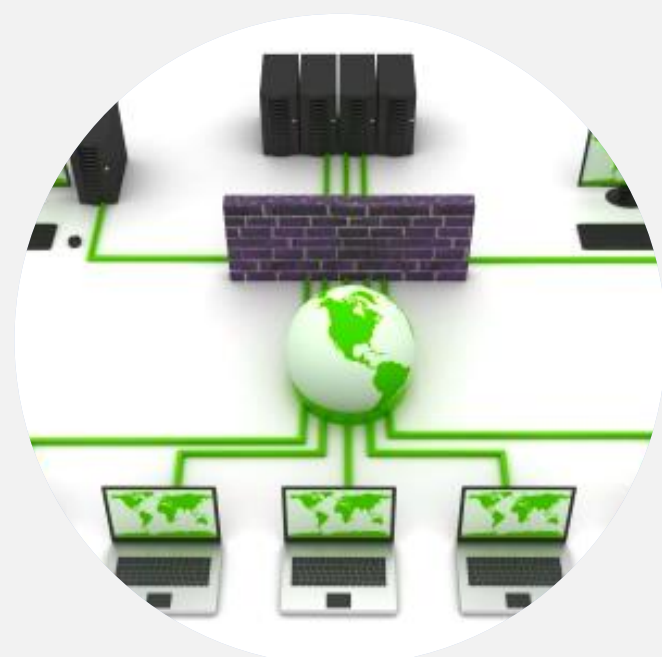
SYSTEMS & NETWORK INTEGRATION