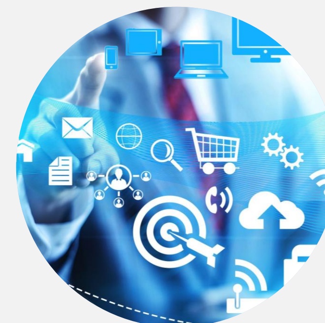
WEB SOLUTIONS & APPLICATIONS